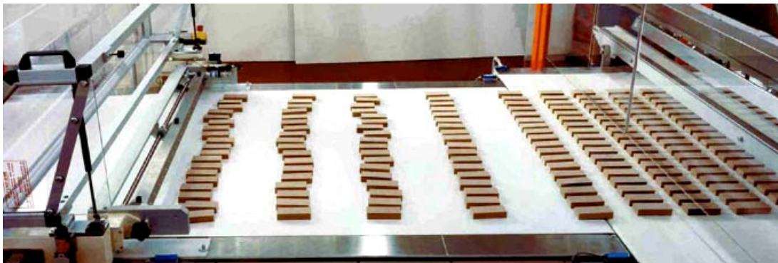
The strongly recommended infeed conveyor of the storage unit complete with row aligner

CM-OPM offers fan buffers to increase the efficiency of the existing lines with a storage unit composed of up to 5 conveyors.