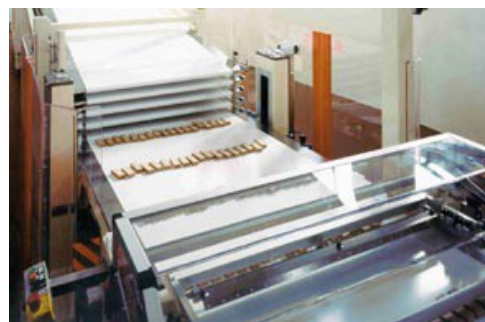
CM-OPM can integrate a vast choice of AGVs for different kind of application

The simplicity of the system makes the solution excellent even for integration on existing lines with a minimum number of modifications and on-site work.